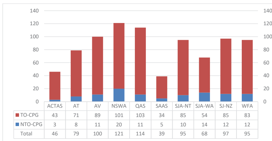
Figure 1. Comparison of non-treatment-oriented (NTO-CPG) and treatment-oriented (TO-CPG) CPGs